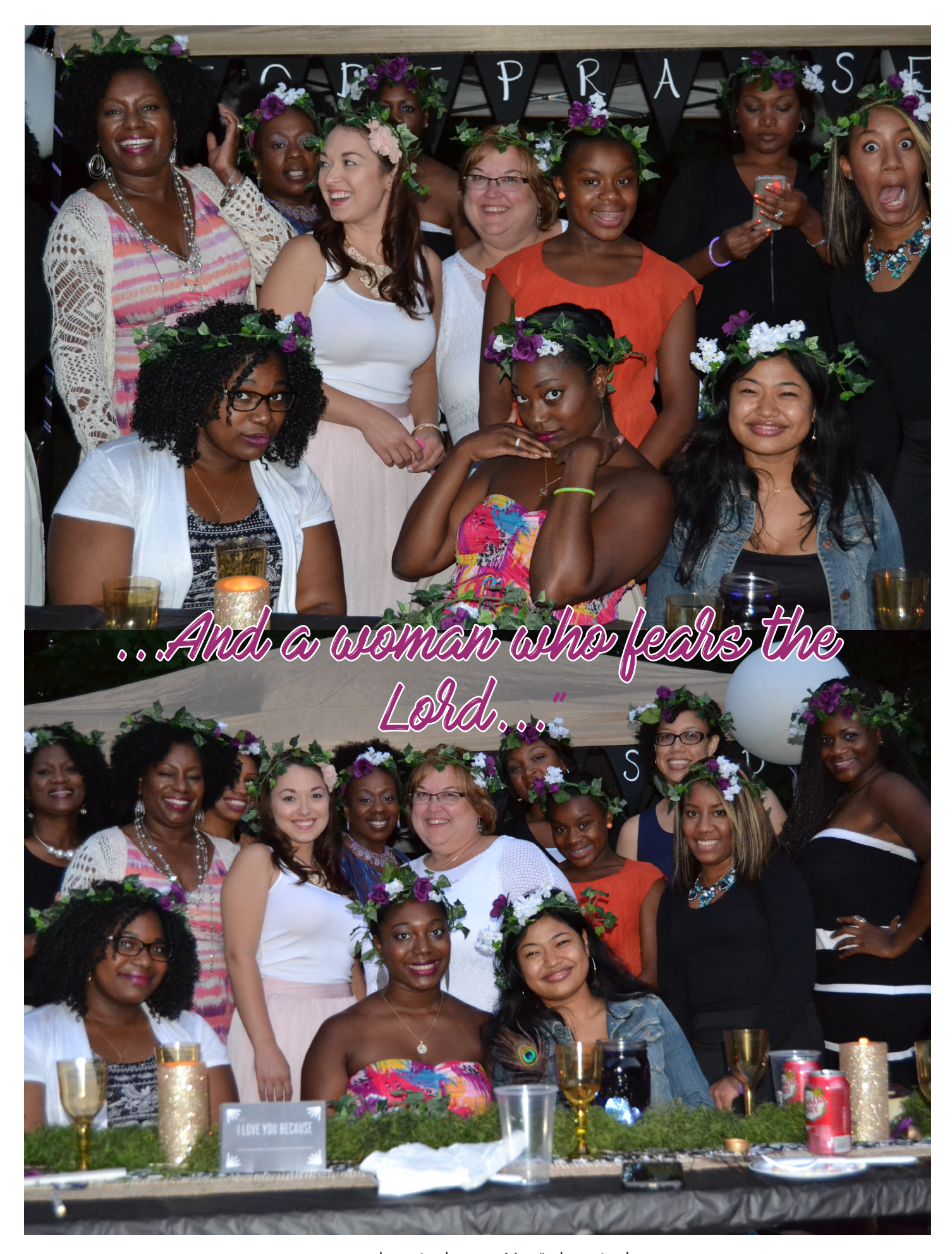
www.tobepraised.com • 11 • #tobepraised