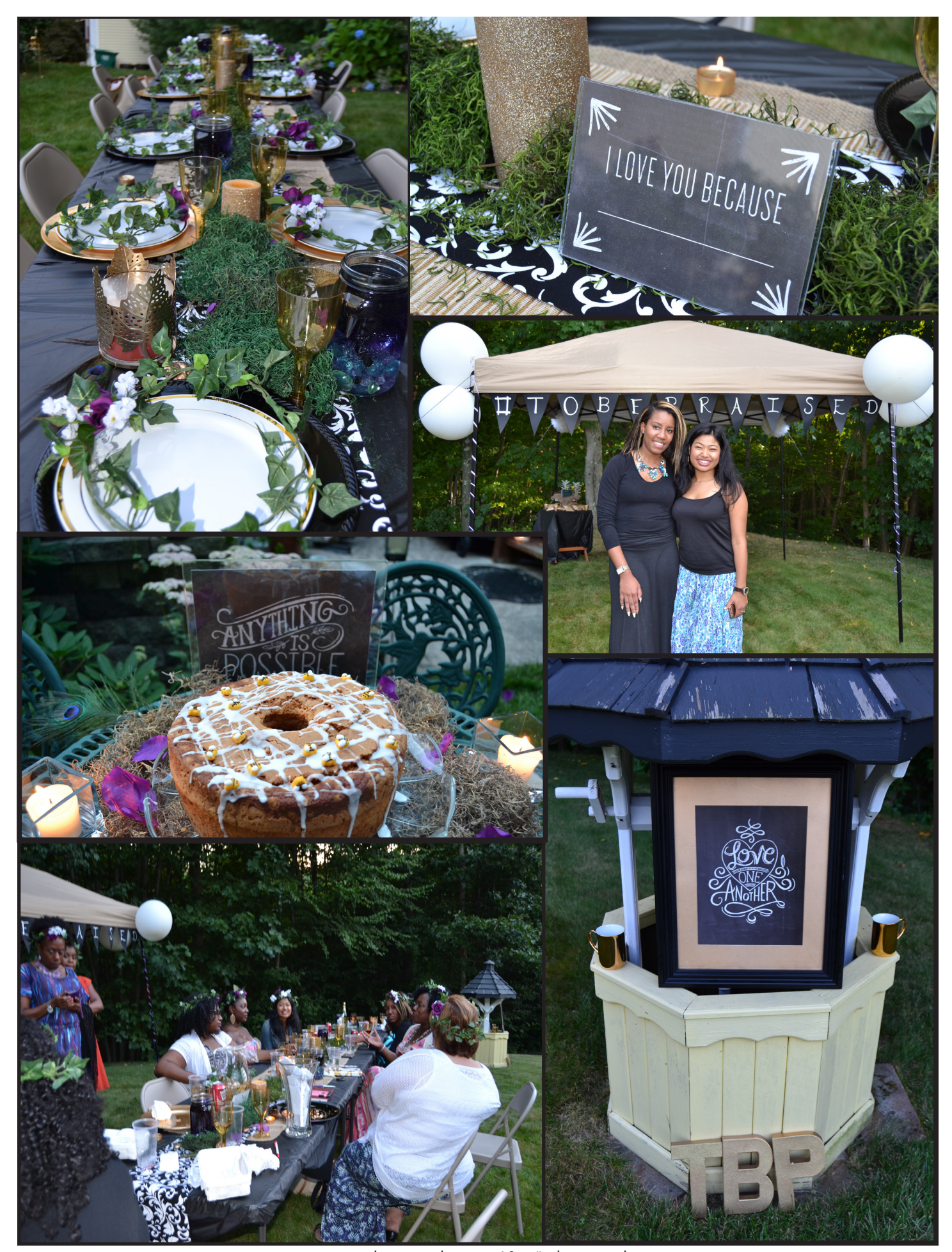
www.tobepraised.com • 10 • #tobepraised